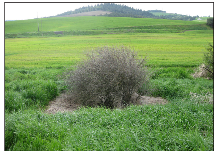
Figure 11. Barberry shrub after foliar herbicide application.

One entire uncut shrub located in an open area away from other shrubs and trees was treated with the foliar herbicidal spray imazapyr (Figure 11). The imazapyr was applied as a 2% solution (by volume) in water; a nonionic surfactant at 0.25% was also added prior to application. The herbicide was applied to all barberry foliage using a backpack sprayer. Imazapyr was selected for this foliar application because