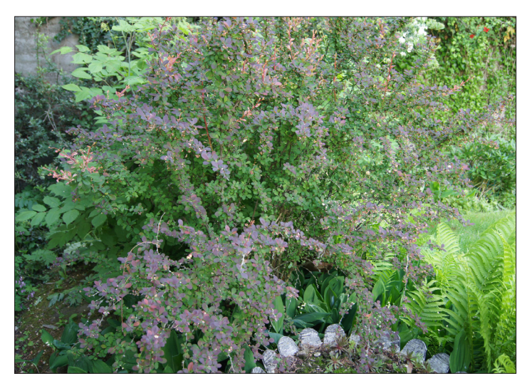
Figure 10. Natural growth shape of Japanese barberry, which are often trimmed into round bushes in landscaping.