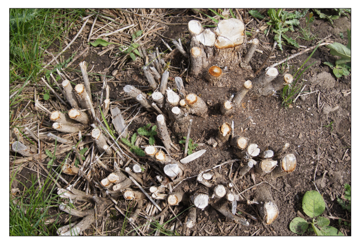
Figure 15. Absence of regrowth one year after cut-stump herbicide application.