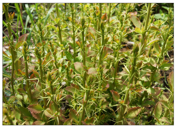
Figure 8. Barberry leaves are spiny-edged and have three spines at the base.