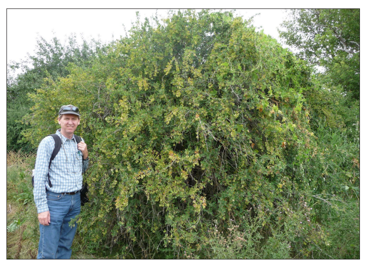
Figure 2. Large barberry bush in June.

The Japanese barberry, common in landscaping, has smooth-edged leaves with usually one spine at the leaf base (Figures 9 and 10). Barberry bushes that are purchased from nurseries today are Japanese barberry types ( Berberis thun bergii ). The Washington State Department of Agriculture inspects the Japanese barberry nursery stock to make sure it is resistant to stem rust.