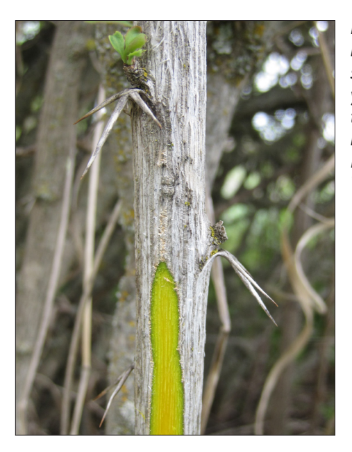
Figure 7. A barberry stem showing bright yellow wood and three spines at leaf bases.