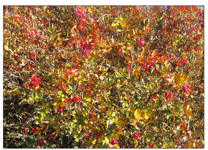
Figure 4. Large barberry bush showing fall leaf coloration.