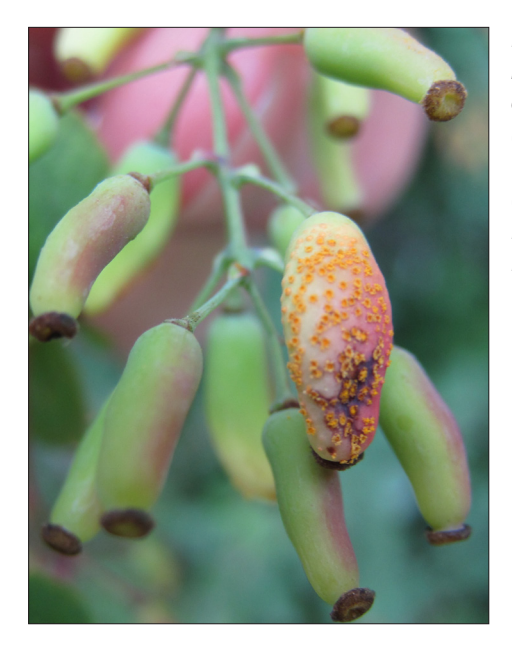
Figure 5. Green berries of the common barberry (in June) infected with stem rust.