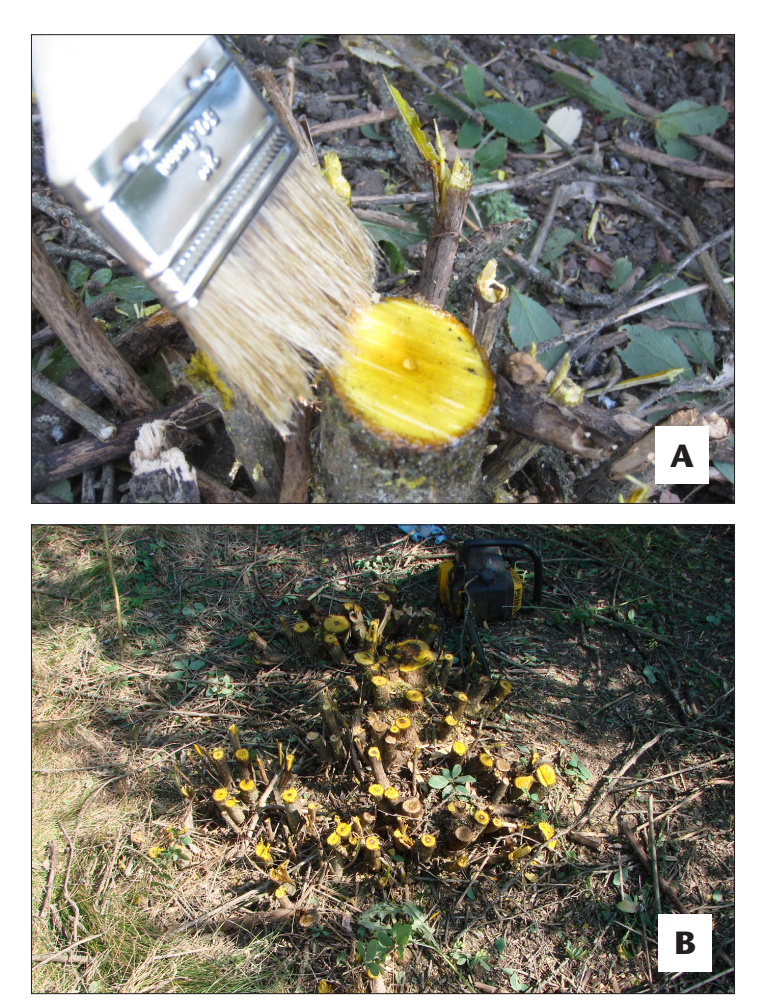
Figure 14. Barberry cut-stump treatments (A) paintbrush application to a stump; (B) stump cluster immediately after herbicide application.

Even though common barberry is not mandated for control in many states or counties, landowners should do their part to control this shrub to prevent the development of new races of stem rust.