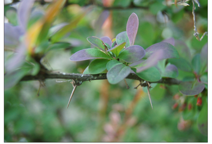
Figure 9. Japanese barberry showing smooth leaf edges and a single spine.