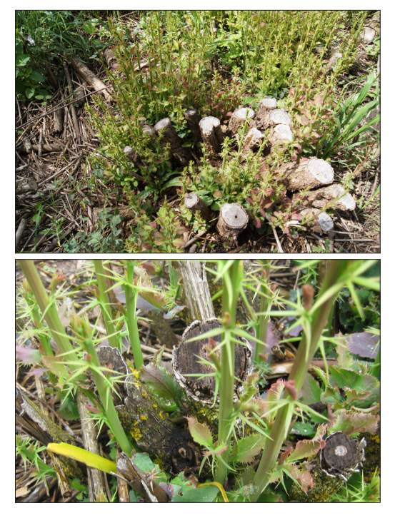
Figure 13. Barberry regrowth one year after cutting (no herbicide applied).

The six shrubs to receive cut-stump treatments were cut approximately 3 inches above the ground, and the cut surface of each stem was immediately treated with imazapyr, picloram, or a mixture of triclopyr + 2,4-D. Herbicides were mixed with crop oil concentrate (without water) at a rate of 100% (by volume), then applied to the stump using a paintbrush (Figure 14). Each stem was treated within a few minutes of cutting because herbicides become less effective if applied after the cut surface has dried.