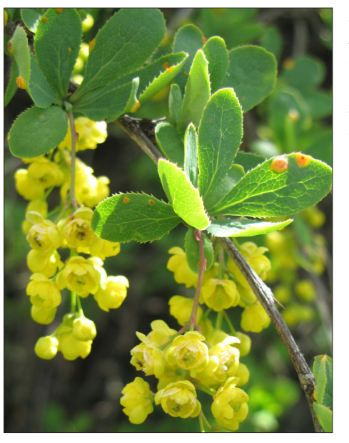
Figure 3. Common barberry flowers (May–June).