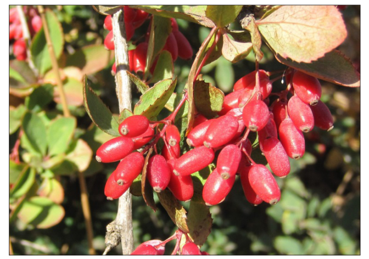
Figure 6. Barberry in the fall showing clusters of red berries.