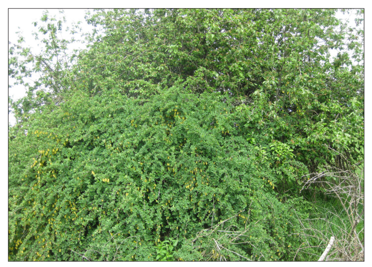
Figure 12. Untreated barberry (used for comparison with treated shrubs) located near other trees and shrubs.

Another uncut barberry shrub was set apart (but adjacent to other trees and shrubs) and left untreated, so it could be compared to treated shrubs to determine the amount of fungal infection developing throughout the year (Figure 12).