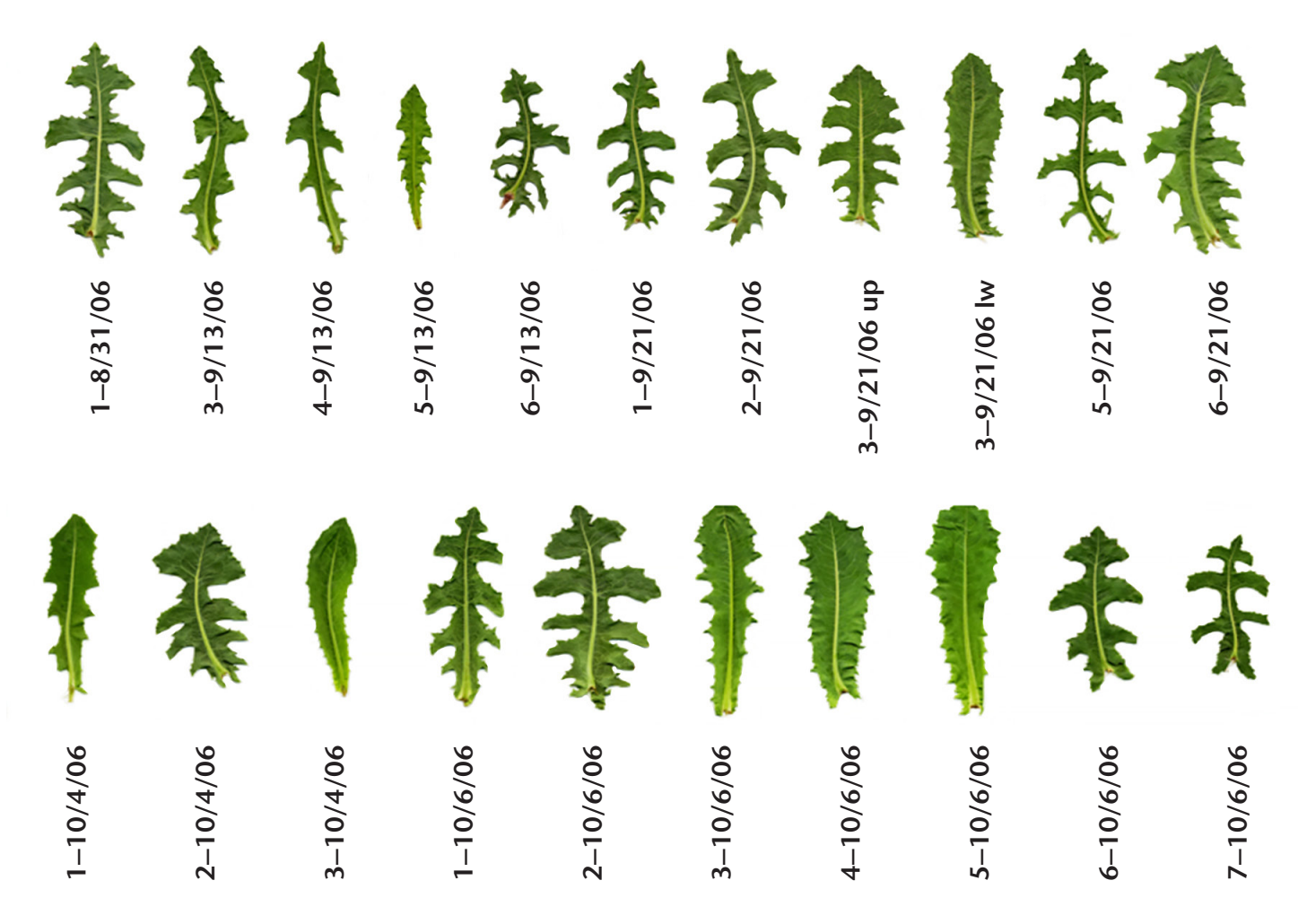
Figure 4. Variable leaf shape in 20 biotypes of prickly lettuce collected in eastern Washington.

Prickly lettuce reproduces only by seed. Seeds are dispersed by wind and are viable and ready to germinate immediately after dispersal. Seeds that are exposed to water may become dormant if they dry before germination. Germination of dormant seeds can be delayed by one to three years.