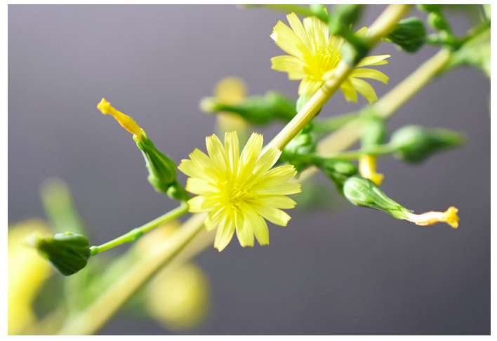
Figure 5. Close-up of prickly lettuce flower heads composed of only ray flowers.