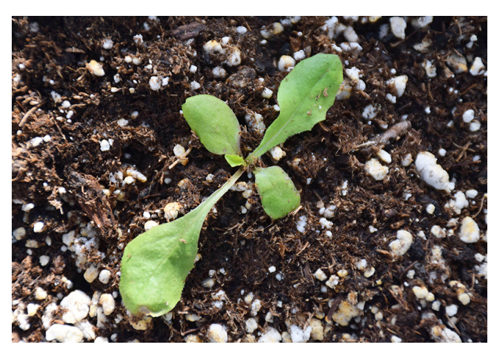
Figure 2. Prickly lettuce seedling with cotyledons (smaller pair of leaves) and first true leaves.