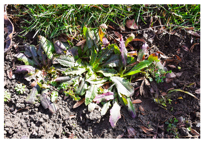
Figure 3. Prickly lettuce seedlings form a basal rosette.