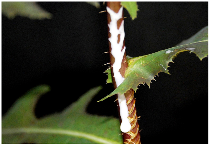
Figure 1. Prickly lettuce produces a milky sap, which is evident when a stem or leaf is damaged, that contains both latex and rubber.

It is interesting to note that plants emerging after the spring equinox often skip the rosette stage, which