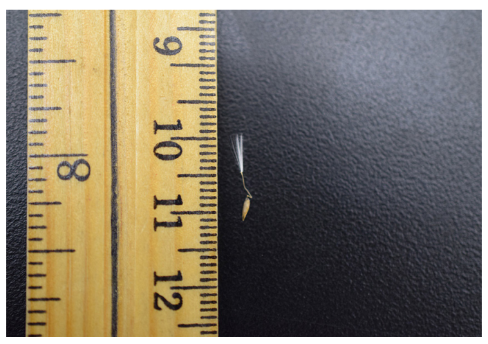
Figure 5. Prickly lettuce seeds are about ½ inch long and contain a pappus, a parachute-like structure that aids in wind dissemination of seeds.

After emergence, a rosette is formed and a long taproot develops. Plants that emerge in the fall will overwinter as rosettes and produce one or more flowering stems in late spring or early summer. Individual plants can produce from 35 to 2,300 flowers. Each flower head contains an average of 20 seeds, giving an estimated seed production of 700 to 46,000 seeds per plant. Prickly lettuce seeds survive in the soil for only one to three years.